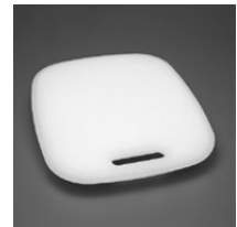
AC21 Synthetic Preparation Board