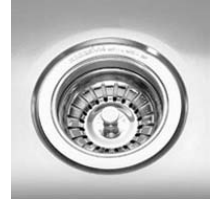
AC09 Basket Waste x 1